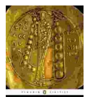
ANNA KOMNENE TheAlaxad