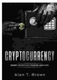
Image Alt Text: An image of a glowing cryptocurrency symbol with the words "Cryptocurrency Money Investing Trading And Risk" written underneath, symbolizing the potential for profit and growth in the cryptocurrency market.

Call to Action: Visit our website or your preferred online retailer to Free Download your copy now and take the first step towards financial freedom in the cryptocurrency era!