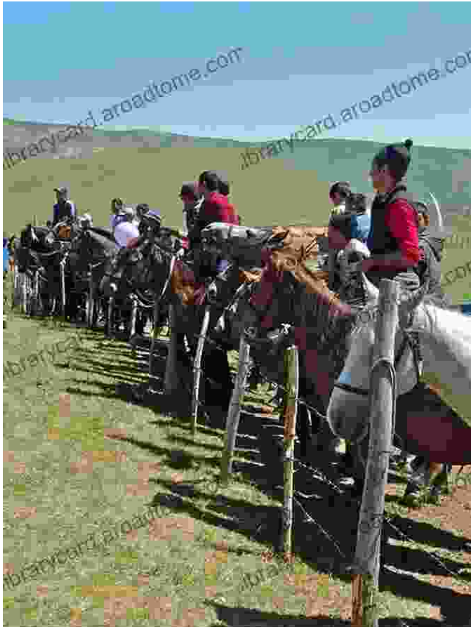
Kyrgyz nomads, a part of the Pamir Highway's cultural landscape.

Along the way, she uncovers the rich tapestry of music, dance, and art that define the cultural heritage of Central Eurasia. From the haunting melodies of the komuz to the vibrant colors of traditional embroidery, the book brings the region's cultural traditions to life.